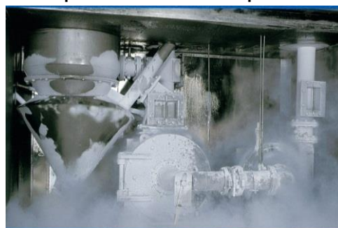
Ultra low temperature pulverizing machine