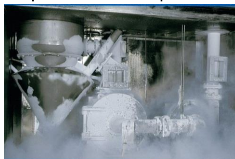
Ultra low temperature pulverizing machine